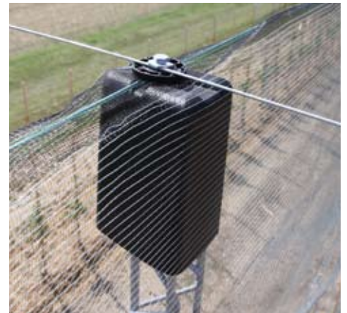
Protective cap, net ring and screw connection