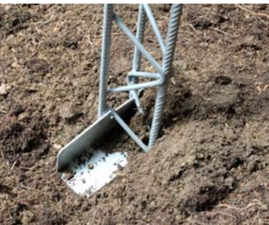
Sink protection support