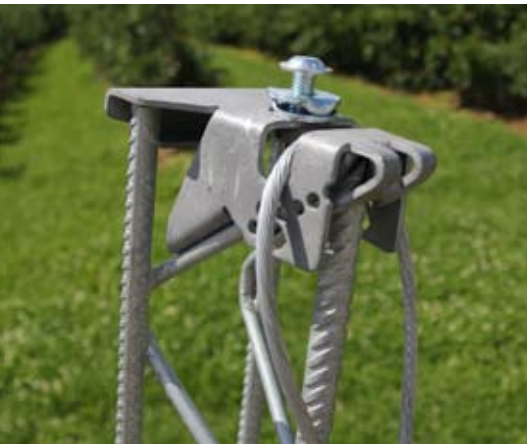
Head section with anchor rope