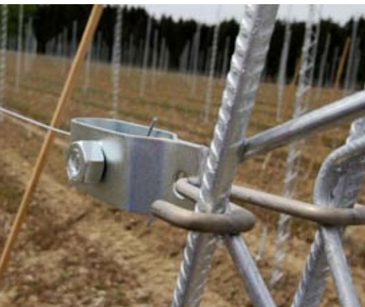
Cultivation wire tightener